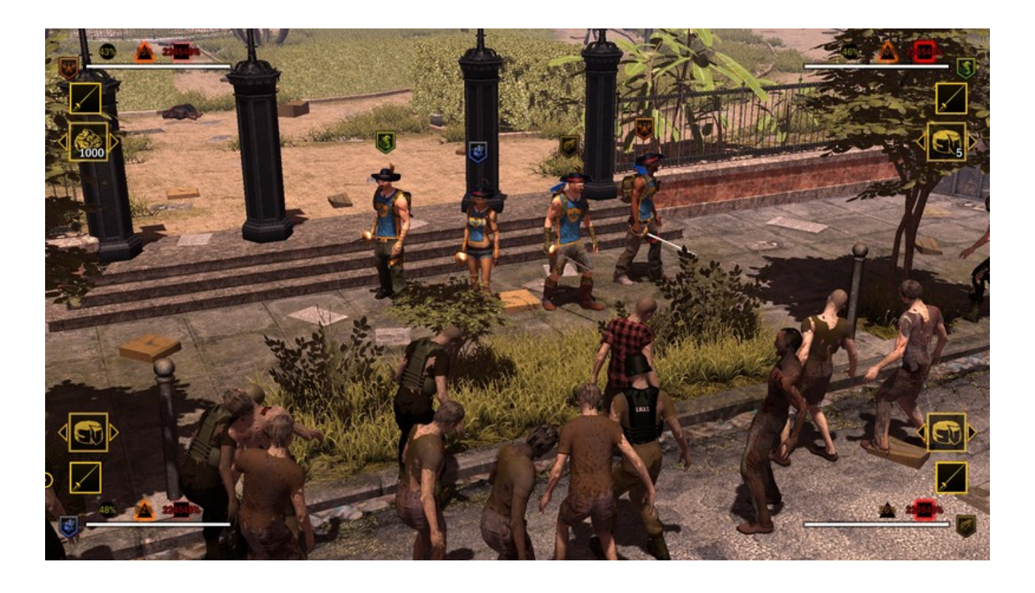
How To Survive 2 - Musketeer Skin Pack Download] [Keygen]

Download ->->-> <a href="http://bit.ly/2NGBO85">http://bit.ly/2NGBO85</a>